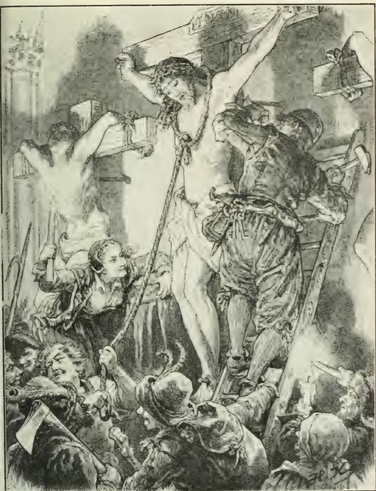
THE MOB IN THE CATHEDRAL OF ANTWERP.